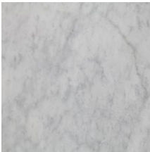
white Carrara marble