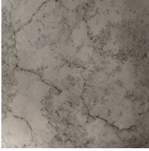
Crackle concrete finish