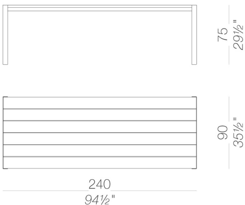
Table with stainless steel legs Aisi 304 powder coated polyester and top in solid Iroko wood. A bench with the same finishes is also available.